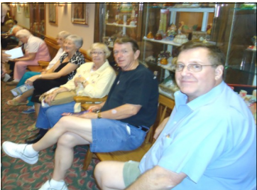
BREAK-TIME! Doctor’s orders!